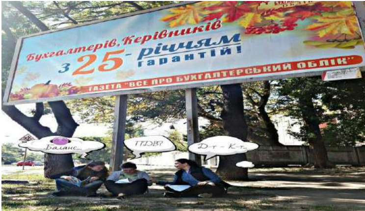
Participation of Master students in the competition of the Professional edition