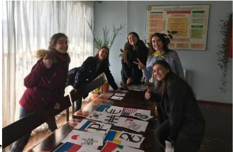
“All about Accounting”