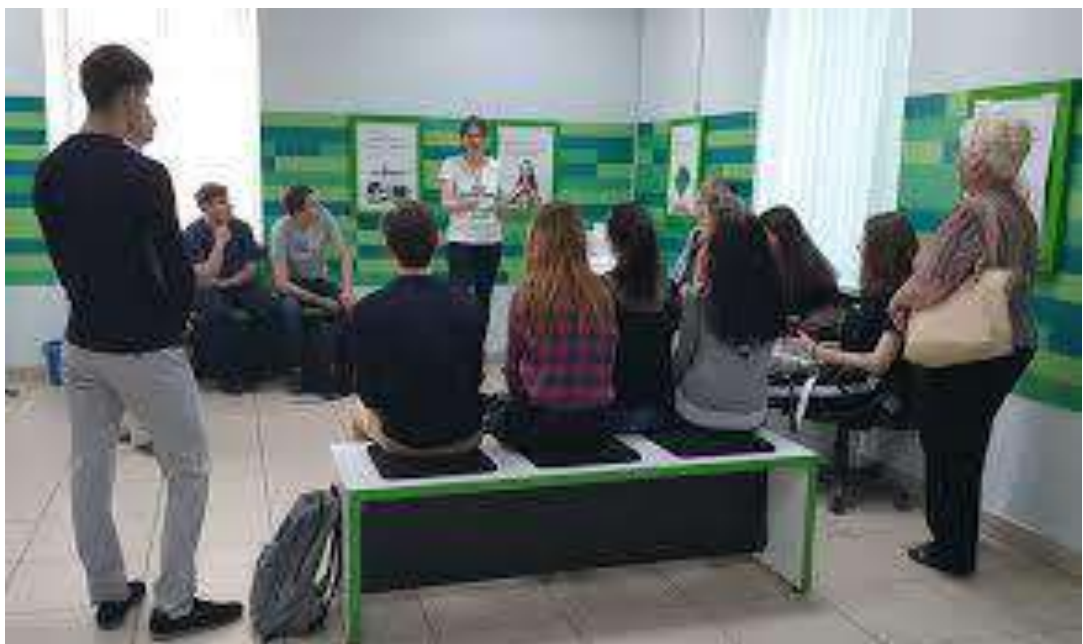
Master students of specialty