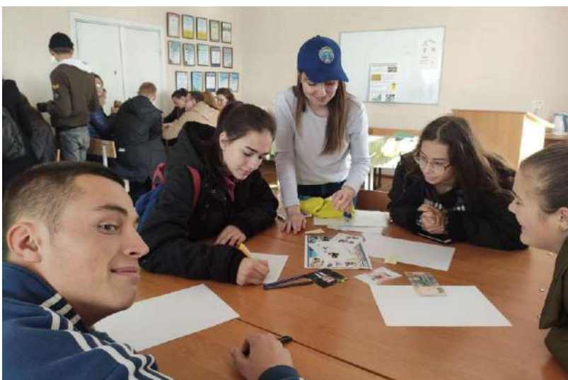
Interactive lesson “The world through the eyes of an accountant”